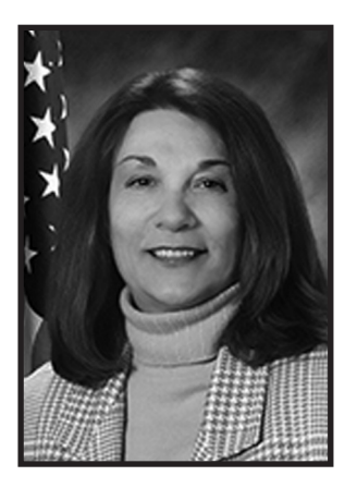
Senator Pamela J. Althoff