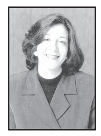
Representative Sara Feigenholtz

ILLINOIS GENERAL ASSEMBLY LEGISLATIVE RESEARCH UNIT