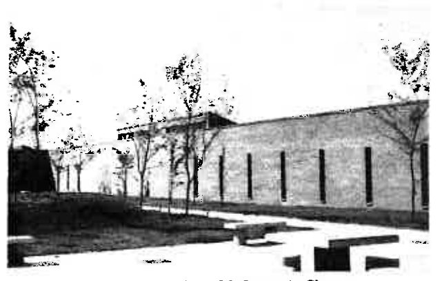
The new Mental Health Center in Chester.

A redecorating program began in 1921 and was completed in 1922. Included in this project was the construction of an auxiliary