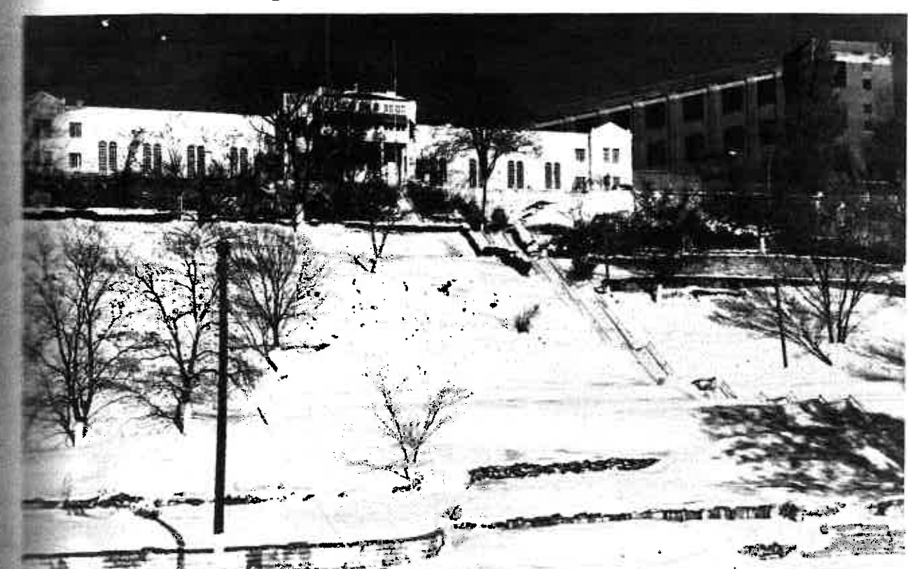
The former Illinois Security Hospital, replaced by the new Chester Mental Health Center.

The Chester Mental Health Center was miginally established by an act of the Gen-📥 Assembly on June 1, 1889, as an "Asylum Insane Criminals." Forty-five thousand tallars was appropriated for the construction he facility. Under the jurisdiction of the Bard of Prison Commissioners it received its st three patients on Nov. 2, 1891. The legiswhite action provided for the transfer of all mate convicts in the penitentiaries at Joliet and Chester, Illinois: for transfer of homiciand dangerous patients confined in other make mental hospitals upon order by the Board; and for commitments under mittimus all county courts throughout the State Minois. In 1910, the name of the hospital was changed to "Chester State Hospital," and matrol of the facility was vested in a board administrators.