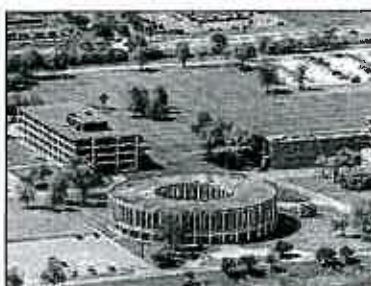
Gov. Pat Quinn has ordered the closing of the Tinley Park Mental Health Center on July 1.

Long ago she was my parents' next-door neighbor in Chicago.